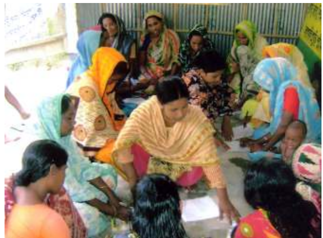
International Literacy Day 2008 celebration at Babrijhar, Nilphamari Pallitathya Kendra

The PK at Kaligang, Jhenaidah operating with the help of Hunger Free World, organised a rally and discussion meeting jointly with the Upazilla Parisad. A large number of students from various schools and colleges participated in the rally and discussion session.