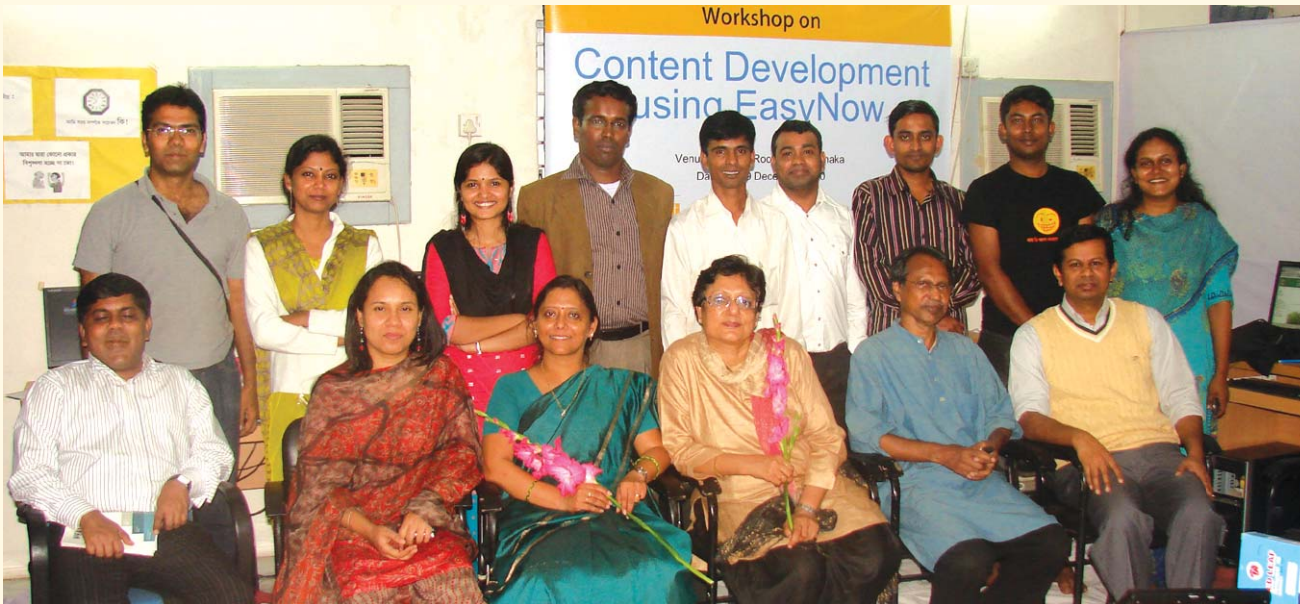
Participants and guests at the closing ceremony of the workshop