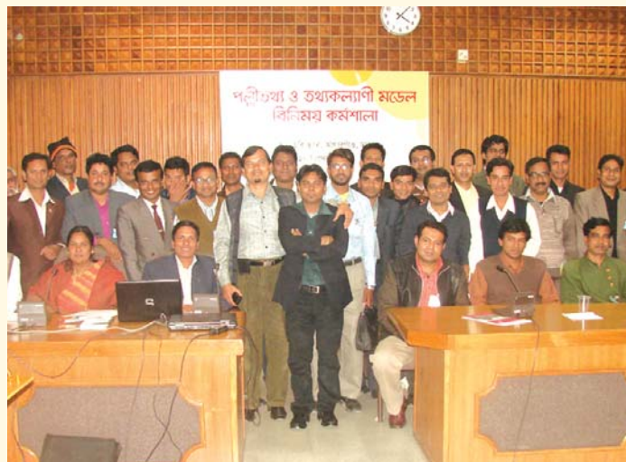
Participants at the closing ceremony of the workshop

A workshop titled "Pallitathya and Tathyakallani Model Replication" was held at IDB Bhanan, Agargoan, Dhaka on December 28, 2010 to enhancement the nationwide replication of pallitathya and Tathyakallani model. The workshop was organized by D.Net with the financial support of Manusher Jonno Foundation (MJF)