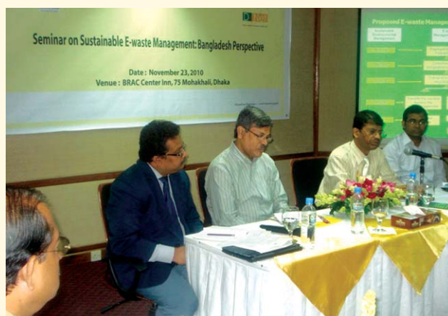
Speakers at the seminar

D.Net organised a seminar on "Sustainable E-waste Management: Bangladesh Perspective" to bring various stakeholders such as policy makers, manufacturers, importers and users together to evaluate the current status of e-waste in Bangladesh and discuss the steps that can be followed for hazard-free e-waste management in Bangladesh. The seminar was held on November 23, 2010 at Conference Room, BRAC Centre INN, Dhaka.