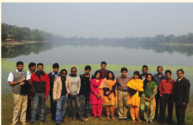
D.Net staffs at Ram Sagar, Dinajpur