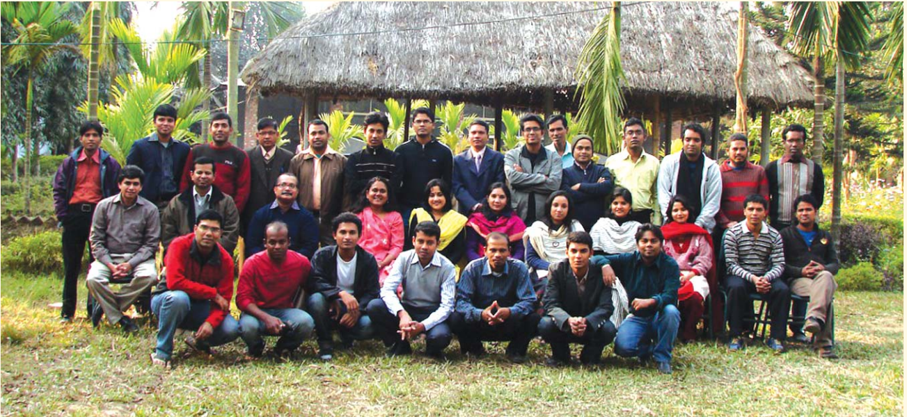
D.Net family at annual retreat in CDA, Dinajpur

D.Net organised its retreat at Dinajpur during December 21-23, 2010. Before the 10th Anniversary on January 13, 2011 it was a great opportunity to plan for next five years by reviewing the Mission 2010 strategy paper. All the Staff of D.Net attended the two day long retreat programme. Two committees had been formed for review of Mission 2010 and prepare next five years plan.