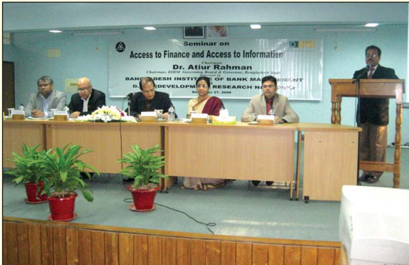
Seminar on Access to Finance and Access to Information at BIBM Auditorium