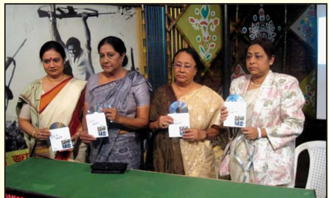
Gunijan launched CD on Lebaration War Heroes

Along with the biographies of freedom fighters, the CD also contains photographs and various written as well as audio-visual documents on them. Gunijan published this CD to preserve the memories of those gallant war heroes and present their story to the young generation.