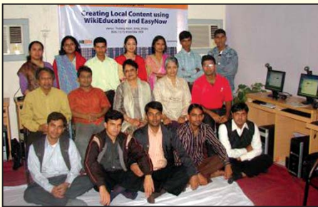
Participants of the workshop with the facilitators

The training workshop was organised for the infomediaries from different telecentres who are involved in content development. A number of open source tools for editing audio and video were introduced to the participants which